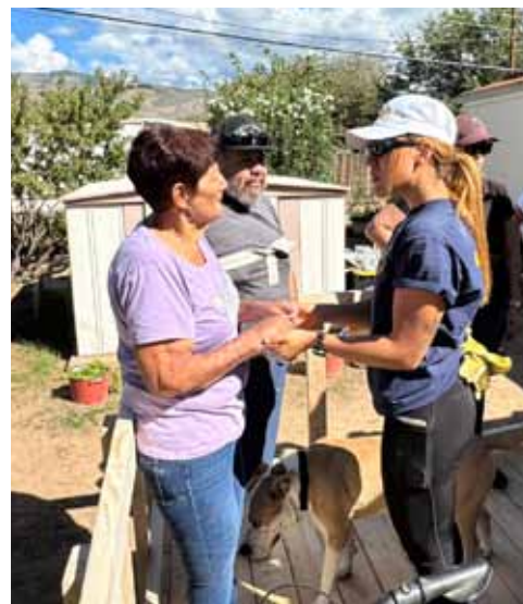
Rotary Club of White Sands Project