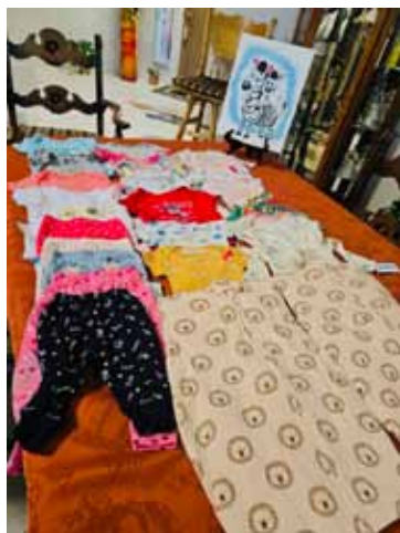
Our Rotary Club is collecting baby and toddler items for Rotary's Year of Cheer! Rotary Club of Albuquerque Sandia