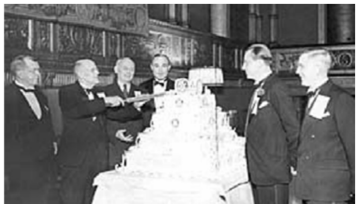
Rotary Founder Paul Harris cuts the cake at the celebration of the Rotary Club of Buffalo, New York, USA, 1936

Paul Harris's attendance at local-club celebrations like the Buffalo event symbolized his continued leadership and the personal connection between Rotary's founder and member clubs across the United States. Photographs of him taking part in anniversary rituals (cake cutting, speeches, public receptions) were used to reinforce Rotary's shared identity and history.