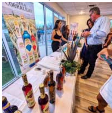
Rotary Club of Los Alamos Fundraiser