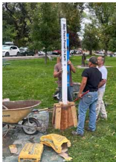
Today is the installation of the Rotary Santa Fe Centro Passport Club and Los Alamos club Peace Pole.