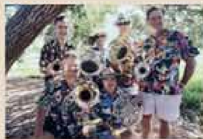
DUKE CITY BRASS