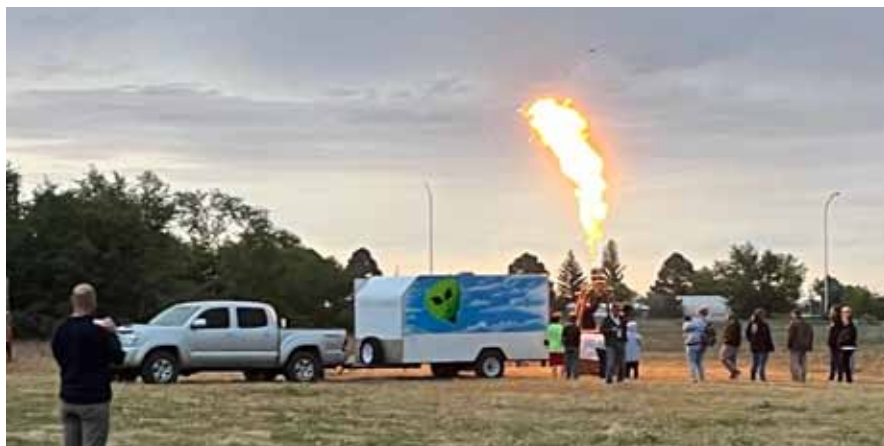
The Moriarty Rotary Balloon Glow was a wonderful success.