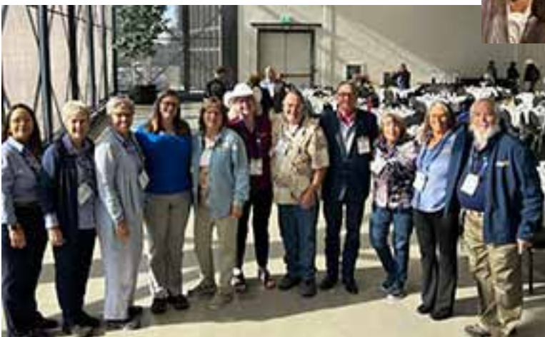
Big West Breakfast