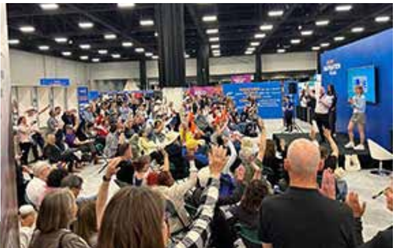
Celebrating 50 years of Youth Exchange