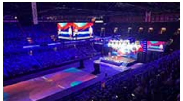
General Conference (I don't see them, do you?)