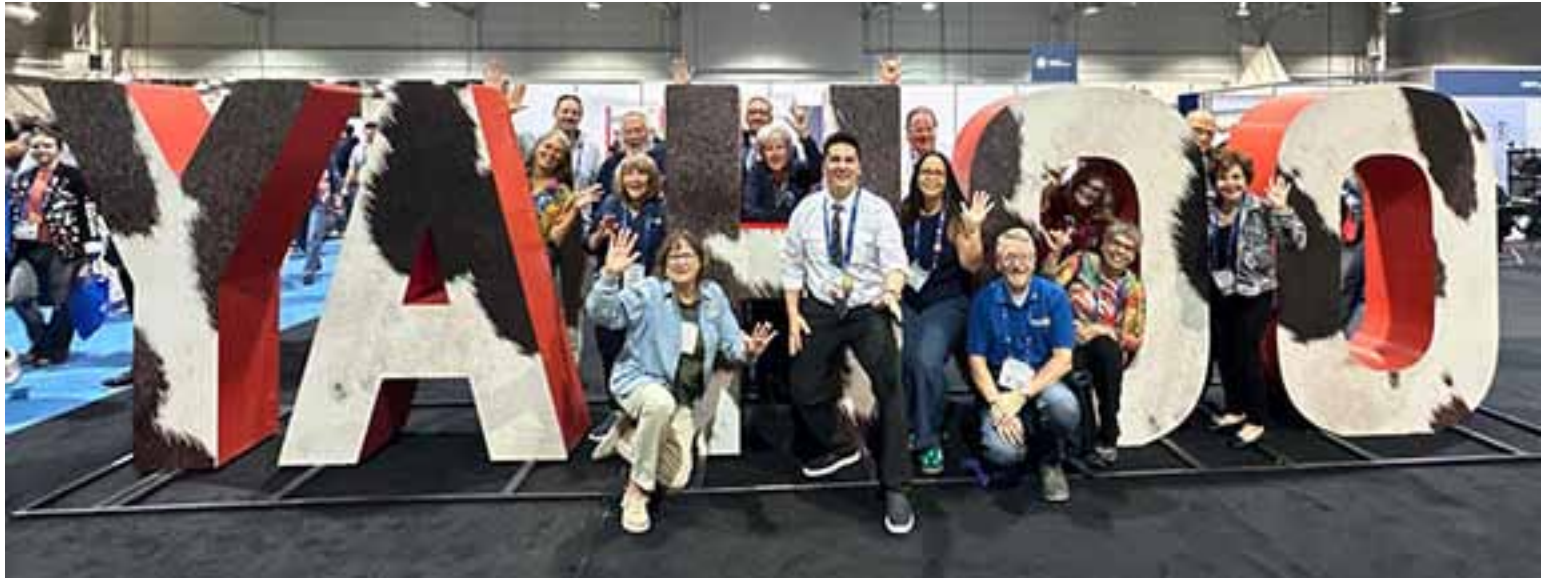
District 5520 members having entirely too much fun!

From June 21–25, more than 16,000 Rotary members from 140+ countries (including about 30 District 5520 members!) gathered in Calgary to explore bold ideas, build connections, and celebrate Rotary's global impact.