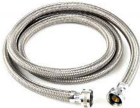
Steel braided hoses

* The standard black hoses typical on a washer hookup are not approved for use as permanent water lines; over time, hoses left pressurized will blister and ultimately explode. Washer hoses that are left pressurized all the time should be stainless-steel braided. The number one claim with all insurance companies is washing machine hoses bursting. The water is constantly under pressure. The normal black rubber hoses become weakened within a few years of installation. Replace those old rubber hoses with these braided steel "no burst" hoses.